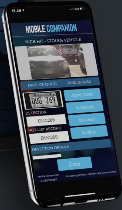
Mobile Companion Android/iOS App