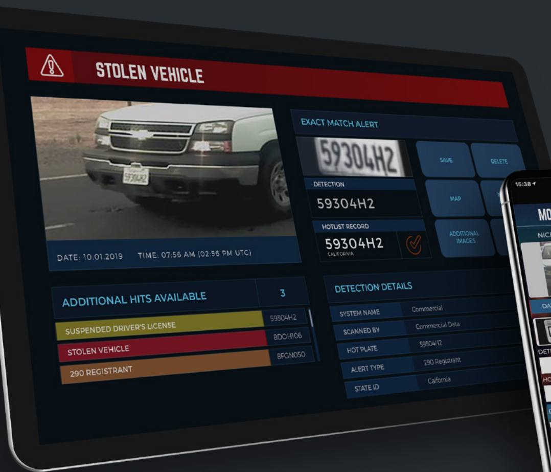
Target Alert Service (TAS) Windows Client