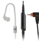
EARPIECE WITH LOUD AUDIO TRANSLUCENT TUBE 1-wire surveillance kit with translucent eartube and in-line PTT/microphone. UL intrinsically safe certified. PMLN8191