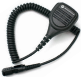
Remote Speaker Microphone