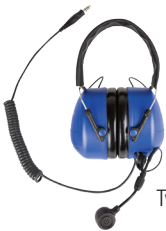
Twin Cup Headsets