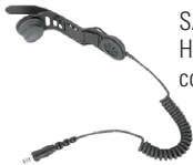
SAVOX HC-1 Helmet communications with bone conductive microphone and ear piece